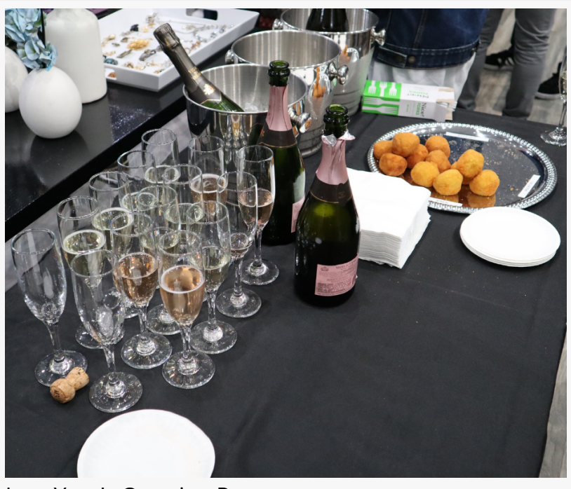
Last Year's Opening Party

The Founder's and staff of The Attic are devoted to providing top quality service and aiding customer's requests in these tumultuous times. To celebrate The Attic's one year anniversary or to shop the latest inventory, please visit: www.theatticny.com