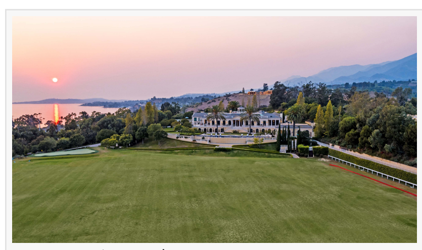
120 Montecito Ranch Lane

Offerings include a one-of-a-kind property atop a private 20-acre oceanview bluff with a world-class, 10-