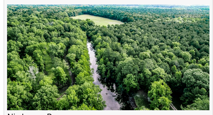
Nix Lower Bayou

$13.995 million, the property will sell No Reserve to the highest bidder.