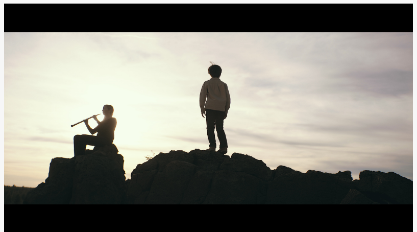
A child discovers the world around him full of orchestral music

This press release can be viewed online at: https://www.einpresswire.com/article/528749137