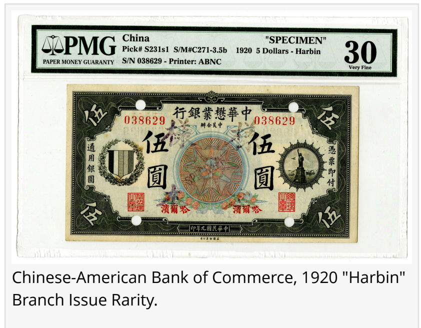
Chinese-American Bank of Commerce, 1920 "Harbin" Branch Issue Rarity.

Archives International is now working on their late Fall and early Winter 2020-21 auctions and are seeking quality consignments for future auctions or outright purchase including U.S. and worldwide banknotes, coins, stocks, bonds, stamps, postal history, historic ephemera, and autographs. To sell or consign one piece or an entire collection, please call AIA at (201) 944-4800; or e-mail them at info@archivesinternational.com .