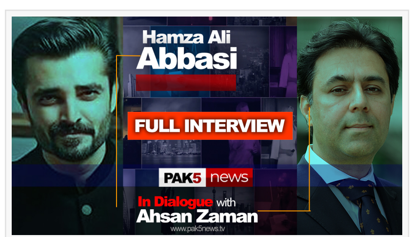
Hamza Ali Abbasi - Full Interview 2020 - In Dialogue with Ahsan Zaman - PAK5 News

The TV and film actor's full interview can now be seen on PAK5 News