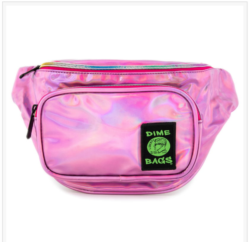
Waist Bag Party Pack in Disco Pink

To be the first to know when these new products and colors roll out, be sure to sign up for text