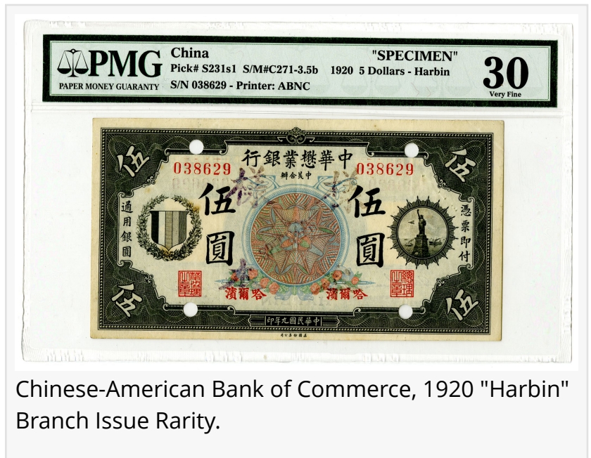
Chinese-American Bank of Commerce, 1920 "Harbin" Branch Issue Rarity.

RIVER EDGE, NJ, UNITED STATES, October 27, 2020 /EINPresswire.com/ -- The October 29, 2020 auction by Archives International Auctions will also consist of 962 lots offered over 1 day beginning with 333 lots of Worldwide and Chinese Banknotes . The World Banknotes will be followed by 535 lots of U.S. & World Scripophily and ending with an additional 94 lots of U.S. Banknotes, Security Printing Ephemera and Historic Ephemera.