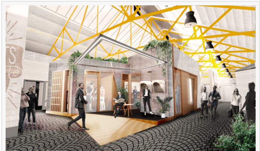
Daniel Owen Ltd Newcastle Office Interior

“During the lockdown, a lot of focus was on making sure our candidates were regularly informed of the changing landscape and that our client partners still had the best site staff during this period. This translated into steady growth at a time when the sector was constantly in flux and reinforced our adaptable approach to client requirements.