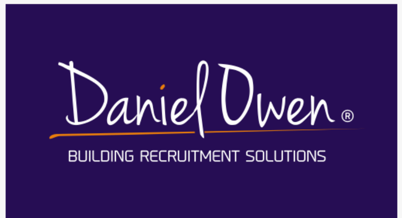
Daniel Owen Logo