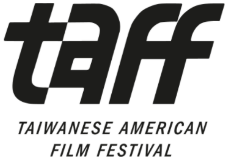
Taiwanese American Film Festival