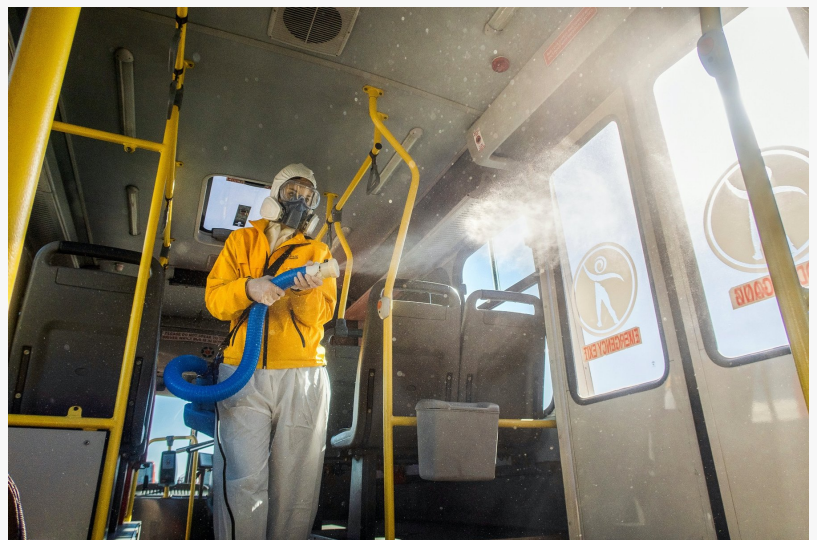
937,000 ambulances, police cars, fire trucks, buses and taxis sanitized in the past seven months

* Handed out 1 million copies of booklets to educate people on how to help themselves and their friends and families stay well.