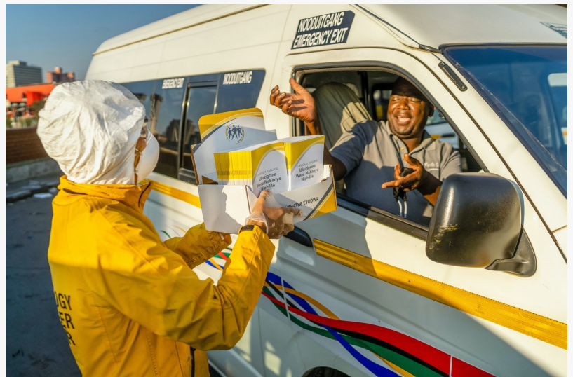
Serving 65 percent of the population daily, drivers of South Africa's minibus taxis received copies of booklet to hand to their passengers

South Africans have completed more than 3,000 Volunteer Ministers courses since the pandemic began. And now those who study in Zulu can avail themselves of this technology for the first time. The technology in the Scientology Tools for Life courses was developed by humanitarian and Scientology Founder L. Ron Hubbard and made available to Volunteer Ministers to provide them with the skills they need to help others. Armed with this knowledge, the motto of the Volunteer Minister is that no matter the circumstances, "Something can be done about it."