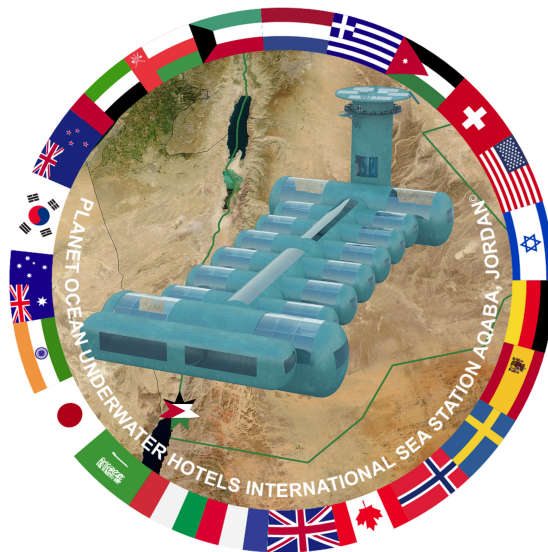
Planet Ocean Underwater Hotels International Sea Station