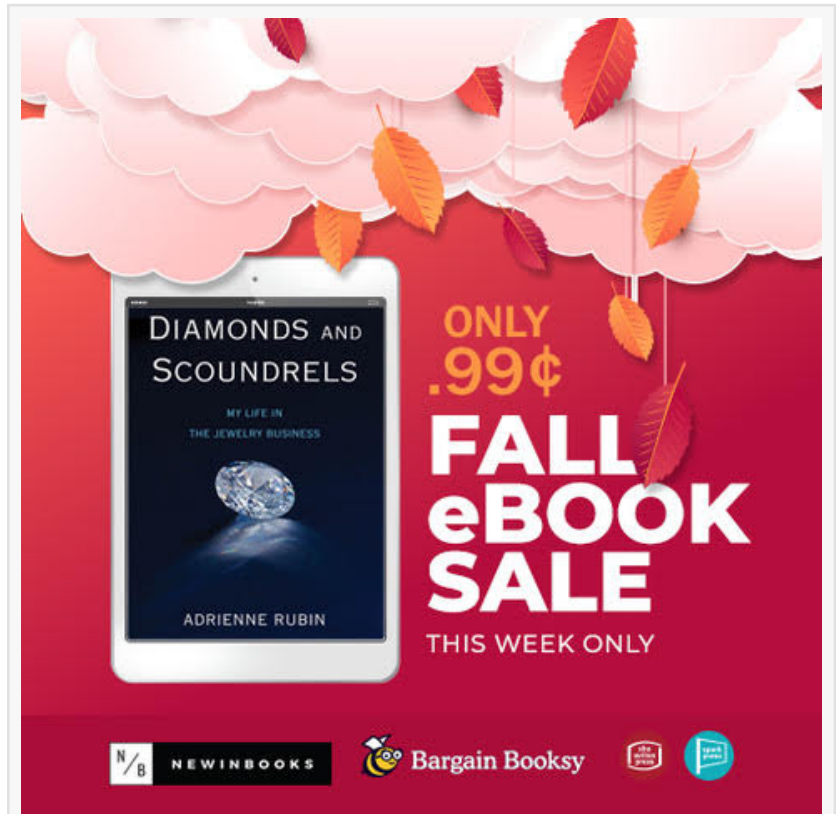
A Sale Price of 99 cents for Diamonds and Scoundrels: My Life in the Jewelry Business