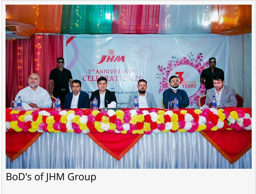
BoD's of JHM Group

Various Business Process involved in Ore Processing. JHM group follows industries' best practices when it comes to coal mining. Here're the key business processes involved mining coal ore.