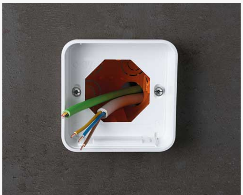
SMART-PANEL base can be located on flush wall boxes - hiding all the cables