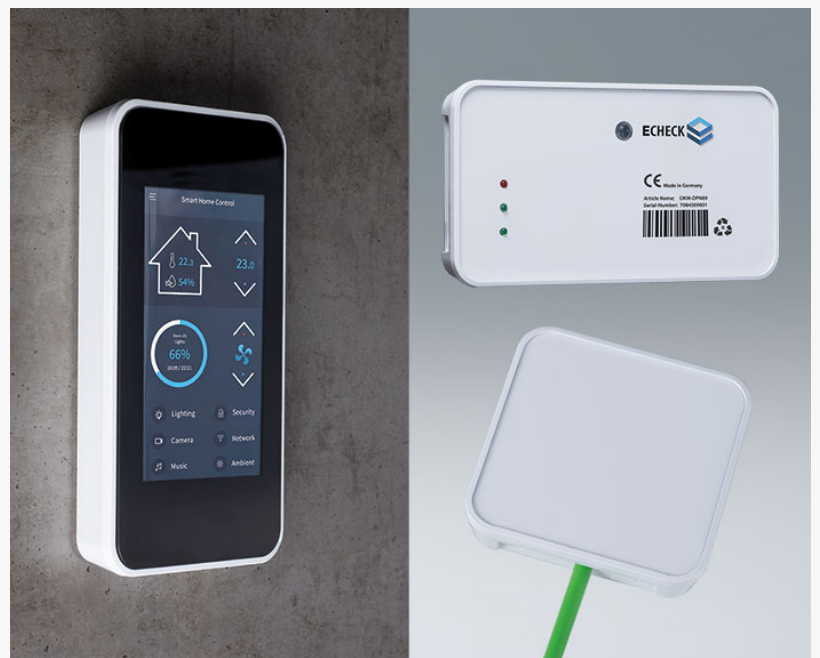
SMART-PANEL wall-mount enclosures for SMART building/office/home technology

There are no visible fixing screws because the top snaps into place – speeding up installation and servicing. The top can be re-opened using a set of push-in opening tools (accessory). The large recess in the top can accommodate a touchscreen, display or membrane keypad.