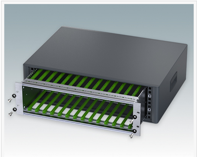
TECHNOMET 19" for mounting 19" subracks, chassis and front panels