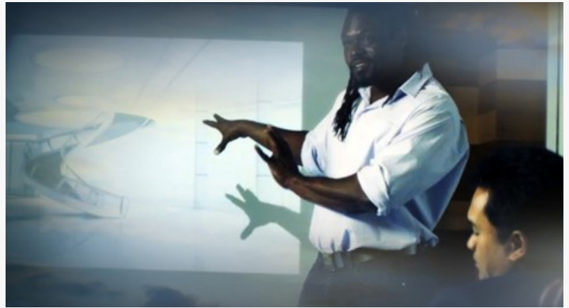
The Communication Course improves basic skills to make virtual and in-person communication effective.

WASHINGTON, DISTRICT OF COLUMBIA, UNITED STATES, October 21, 2020 /EINPresswire.com/ -- With more virtual meetings and less in-person communication during the pandemic, it is more important than ever to learn how to communicate well in order to be understood. As part of the Volunteer Minister program of the Church of Scientology, a free communication course is being offered online. It only takes a few hours to complete, but will improve communication skills for a lifetime.