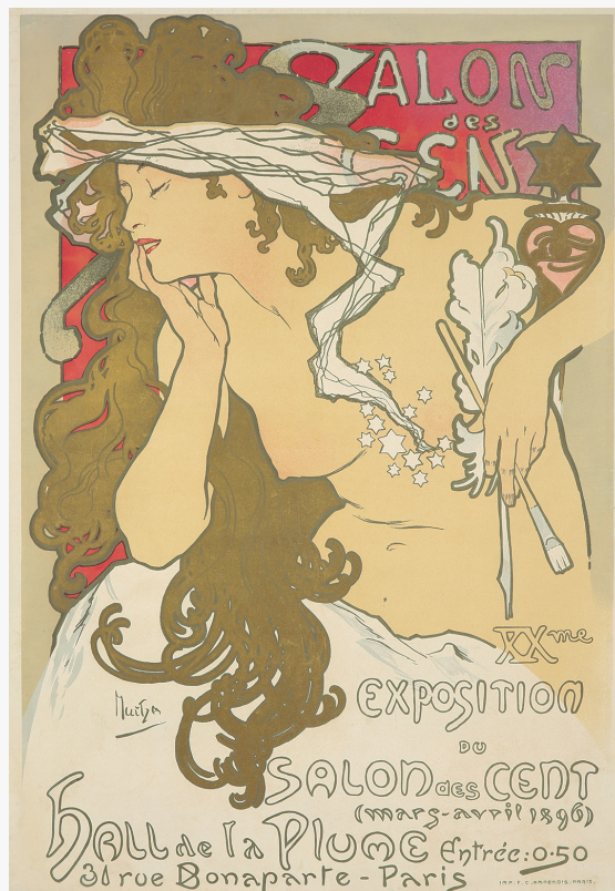
Alphonse Mucha, Salon des Cent / XXme Exposition . 1896. (est. $12,000-$15,000).