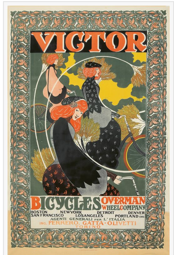
William H. Bradley, Victor Bicycles / Overman Wheel Co. 1896. (est. $20,000-$25,000).

The War & Propaganda collection includes poignant and powerful designs from World Wars I and World War II, as well as hand-painted posters from the Vietnam War. Highlights include James Montgomery Flagg's 1917 designs I Want You for U.S. Army (est. $7,000-$9,000) and Wake Up,