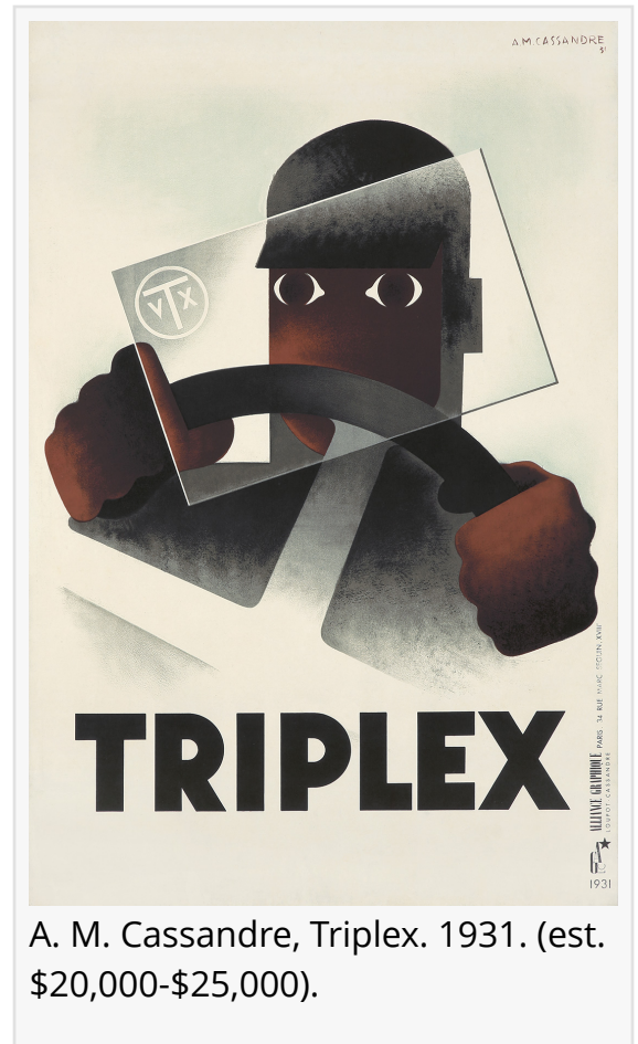
A. M. Cassandre, Triplex. 1931. (est. $20,000-$25,000).

Alexandre Steinlen: a rare variant of his most famous design, Chat Noir / Réouverture from 1896 (est. $20,000-$25,000); the charming 1894 Lait pur Stérilisé (est. $12,000-$15,000); and the only known copy of Nestlé's Swiss Milk, from 1895, with text promoting the printer G. Gerin Fils (est. $17,000-$20,000).