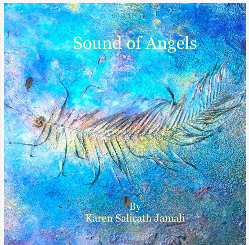
Album Sound of Angels