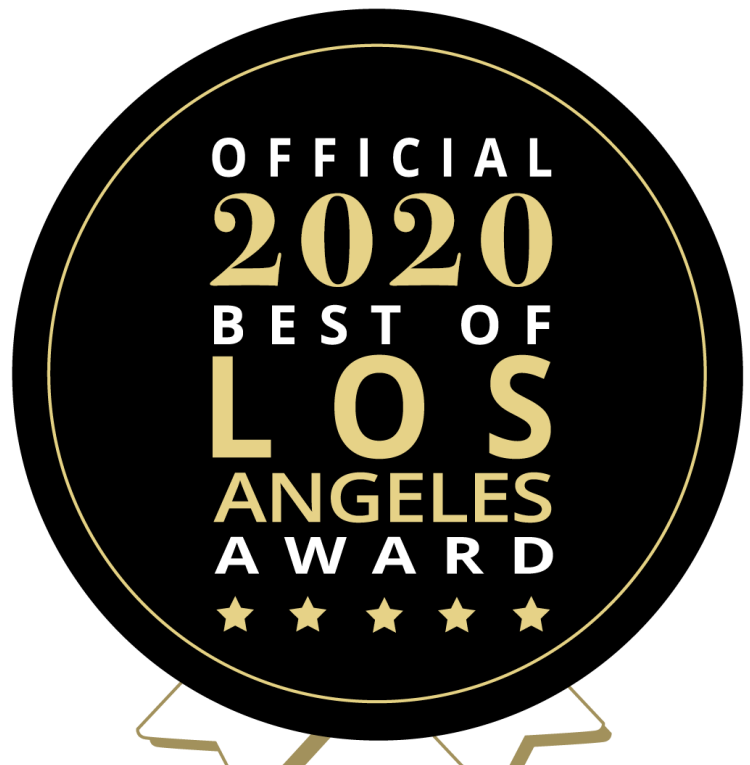
Best of LA Award