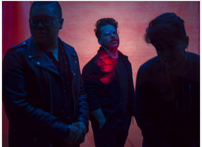
ARIZONA Live in Nashville Concert Experience on October 29th

ARIZONA have made a stunning leap forward with their latest new album, ASYLUM. The album – which follows the NJ-based trio's breakthrough debut album, GALLERY – sees them driving their signature approach to remarkable new heights, fusing groundbreaking pop technique with creative visual design and uncommon textural depth. Multi-faceted tracks such as "Problems" and "Still Alive" reveal a profound and powerful sense of community, fueled in part by the band's exploration of their