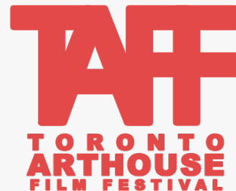
Official Logo of the Toronto Arthouse Film Festival