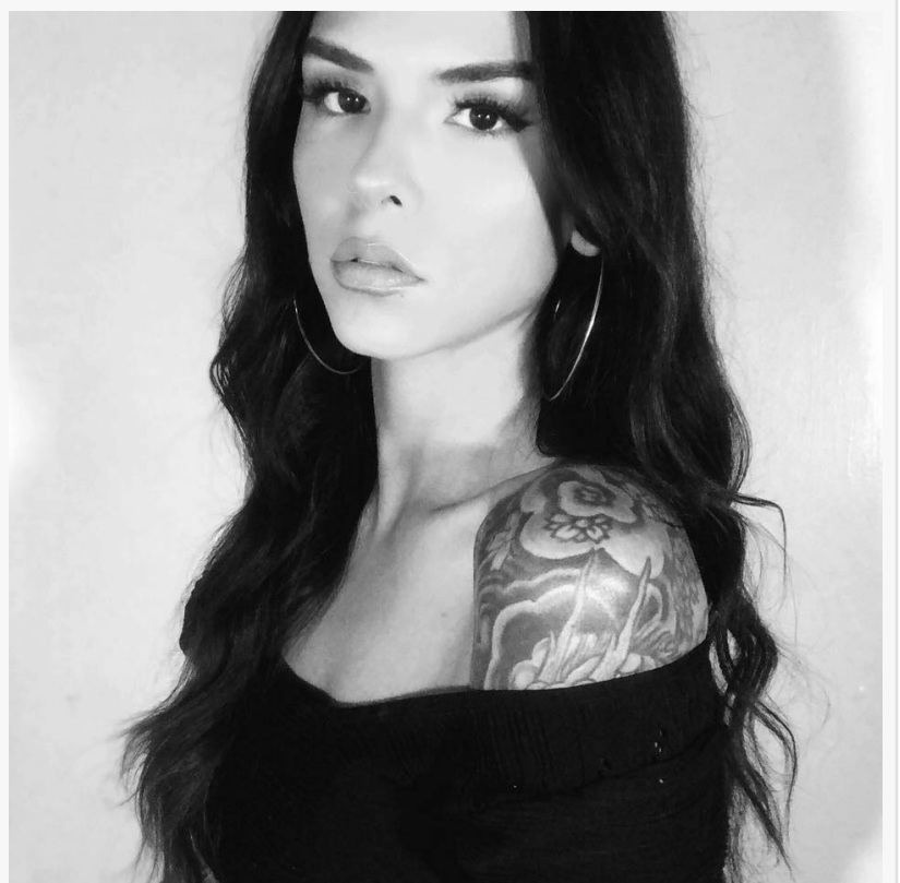
Frenchy Valens Press 1

Listen to “Crazy” now: https://youtu.be/NYEoLwSk9U8