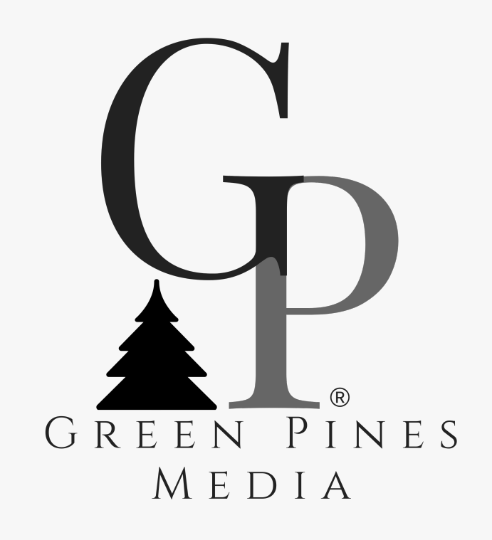
Green Pines Media

never had a chance." from the vocabulary of Transition-Aged Youth artists between the ages of