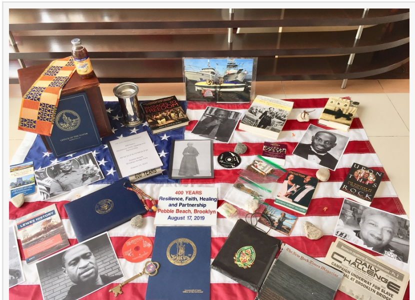
Time Capsule items

Hashtags: #400years, #Resilience, #Healing, #Faith, #Partnership, #ExtremeFaith, #Ireland, #EquatorialGuinea, #GuineaEcuatorial