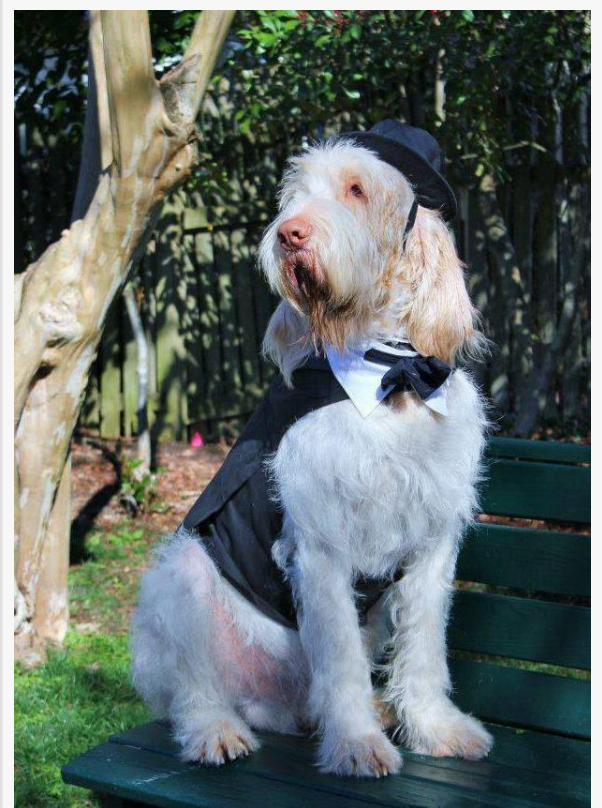
Canine Philanthropist Ecco D'Oro