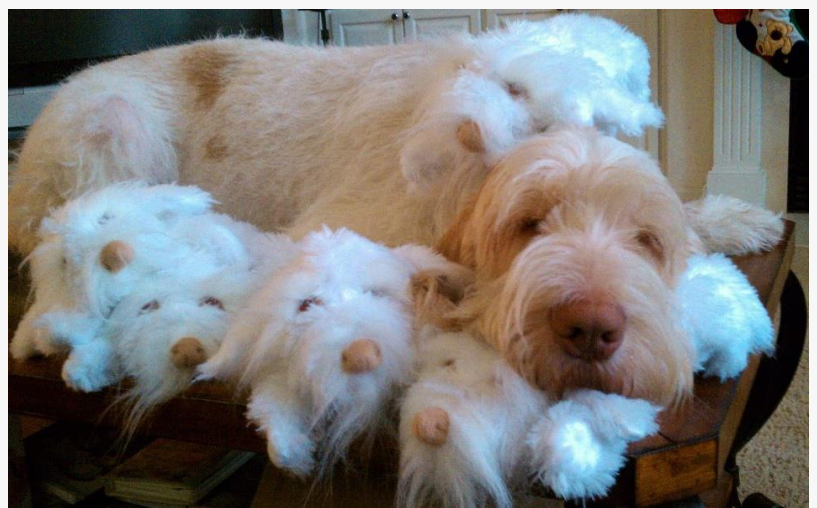
Ecco D'Oro with Eccolins

'As Ecco's popularity grew, unexpected things began to happen. Children wrote letters to Ecco. One in particular made an impact that will stick with me for the rest of my life. A little boy disclosed how he was being bullied and contemplating suicide. This child confided in a dog, not a human. This would not be the first child who messaged Ecco in despair and at that moment, I knew our true purpose.