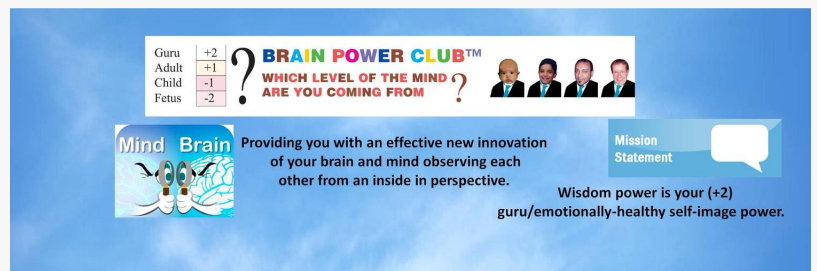
The quality of the self-image of the leader determines the quality of leadership.