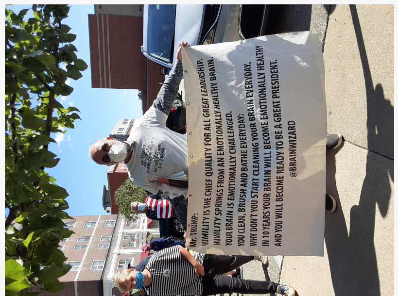
My banner I displayed all over.