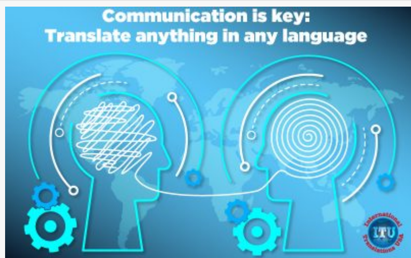
TRANSLATING ANY LANGUAGE

Our services are used extensively by courts, law firms, businesses, and individuals. We can provide details of specific clients on request.