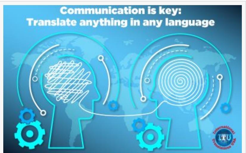
TRANSLATING ANY LANGUAGE

They will sit down with you and discuss your project intimately listening to what you want achieved in your translation project and they will listen to your needs and concerns. They will produce top-quality translated documents every time they guarantee it.