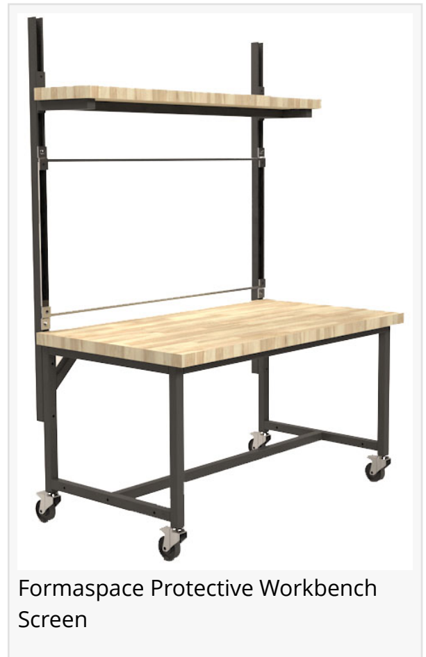
Formaspace Protective Workbench Screen

In what may be an all-too-familiar refrain, the Coronavirus pandemic may be responsible for yet