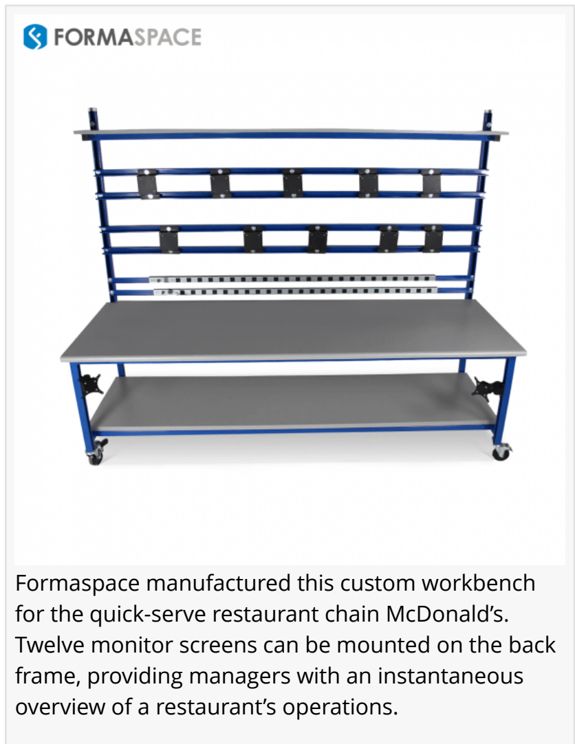
Formaspace manufactured this custom workbench for the quick-serve restaurant chain McDonald's. Twelve monitor screens can be mounted on the back frame, providing managers with an instantaneous overview of a restaurant's operations.

Restaurants and institutional food-service operators (including school cafeterias) were the largest single purchasers of our nation's food products prior to the Coronavirus outbreak.