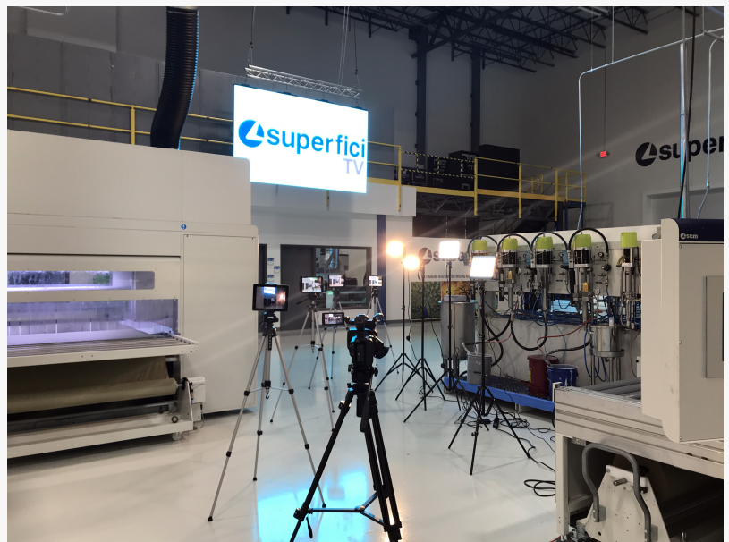
SuperficiTV Live Broadcasting