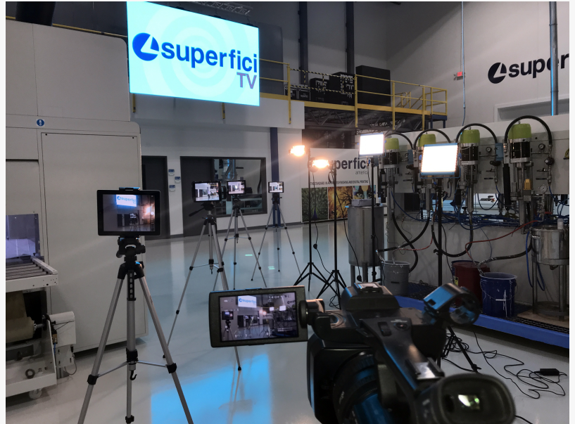
Superfici TV Is LIVE

CONCORD, NC, UNITED STATES, October 29, 2020 /EINPresswire.com/ -- In order to bring an immersive and client directed "hands-on" testing experience directly to customers throughout North America, Superfici America has transformed their Technology Center into a multi-camera broadcast TV studio .