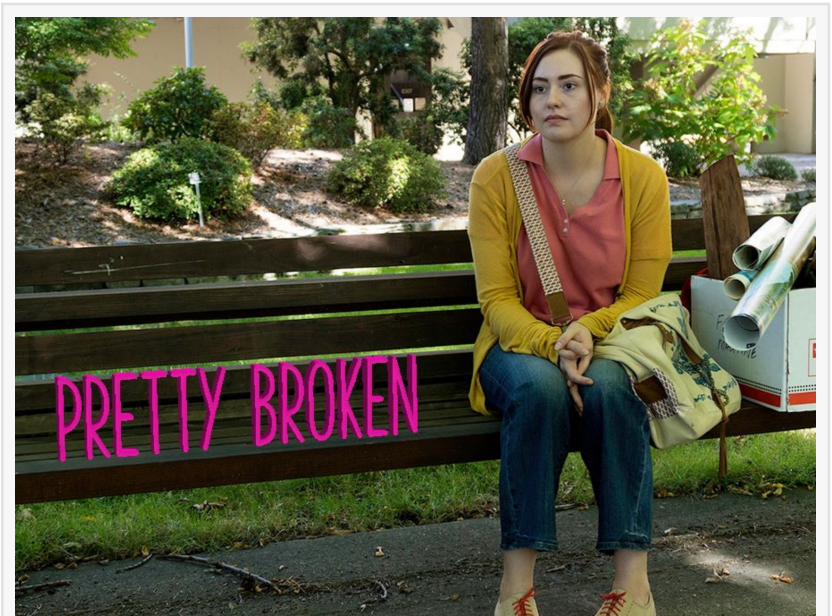
Pretty Broken Image 1

Resonance Productions is an award-winning production company that serves a wide range of