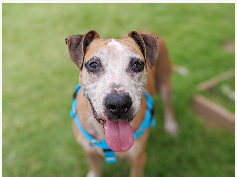
Baylord, 8, is ready and waiting to be adopted at the Maui Humane Society.

directors, volunteers and senior dog adopters, found that the situation is changing and highlights innovative strategies to help save more at-risk senior dogs, age 7 and older.