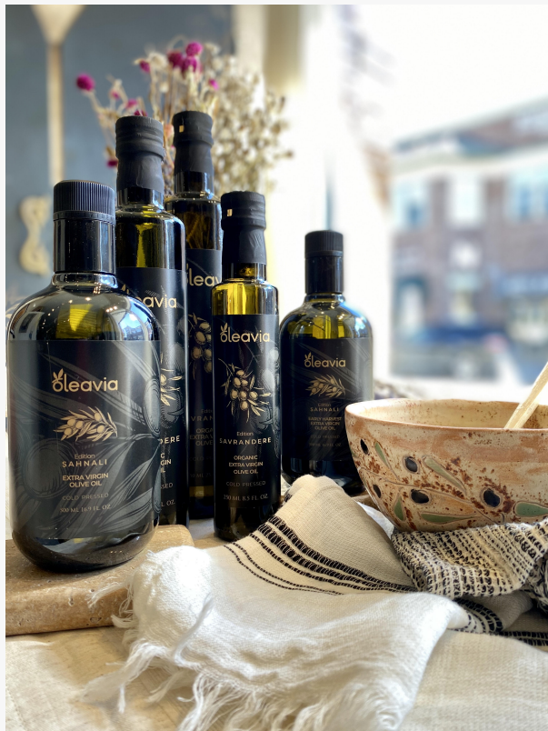
Award winning Organic Extra Virgin Olive Oils