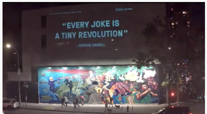
Race To The End + Walltime Projection in the Bowery, New York City