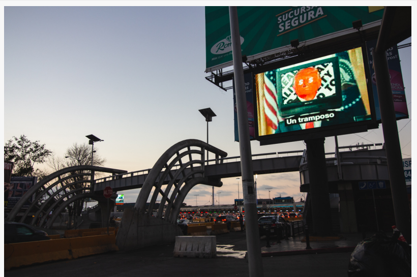
Imagery from the artist PISCO calling President Trump "a cheater" in Spanish at the San Ysidro border crossing

/EINPresswire.com/ -- The End Collective announce the launch of "Race To The End", a 50+ artist group show of anti-Trump works. The project is broadcasted non-stop simultaneously on multiple streaming sites (Twitch, YouTube, etc) and is currently live on giant digital billboards displayed as you enter the U.S. from the Mexican Border and is projected daily on a massive wall in the Bowery, New York City.