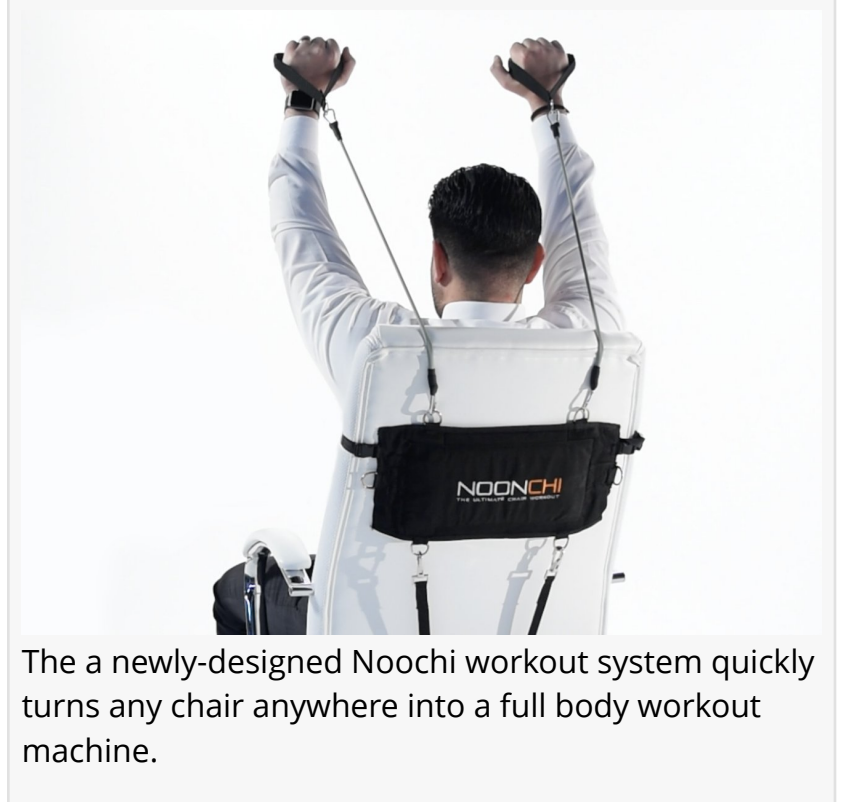
The a newly-designed Noochi workout system quickly turns any chair anywhere into a full body workout machine.