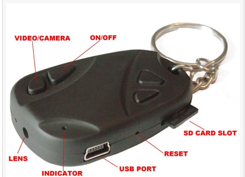
High defination key fob video / photo spy camera.