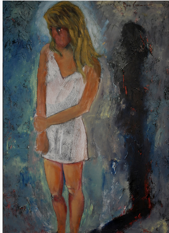
I Am Not Alone