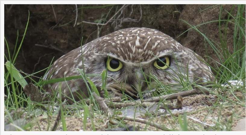
This unwise plan would wipe out wildlife, including this owl, photographed in Ballona Wetlands.

not change. Critics of the bulldozing plan point out that the public could be granted considerable access right now, without a decade of destruction and the decimation of wildlife. However, a large, artisticgate, that was built with public funds, remains locked, depriving the public of access to trails, bike racks and benches that are ready to use. And, who holds the key to that gate? SoCalGas.