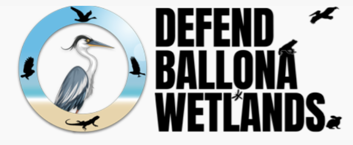
Defend Ballona Wetlands: environmentalists banding together to stop senseless habitat destruction.

Green Dream Campaign. In Defense of Animals has led the charge against the obliteration of the wildlife at Ballona, urging public officials, including California Governor Newsom, to scrap the ill-