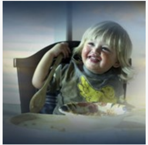
The on-line course "Children" is based on a booklet from "The Scientology Handbook".

Today, with more children staying at home due to COVID-19 restrictions, many parents would like to improve their parenting skills.