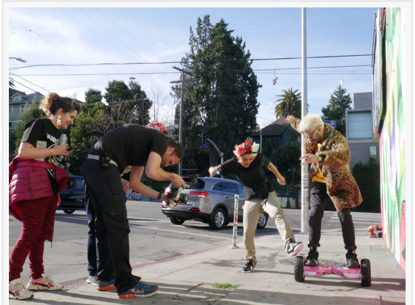
"Slashing Silverlake"

This press release can be viewed online at: https://www.einpresswire.com/article/529591250