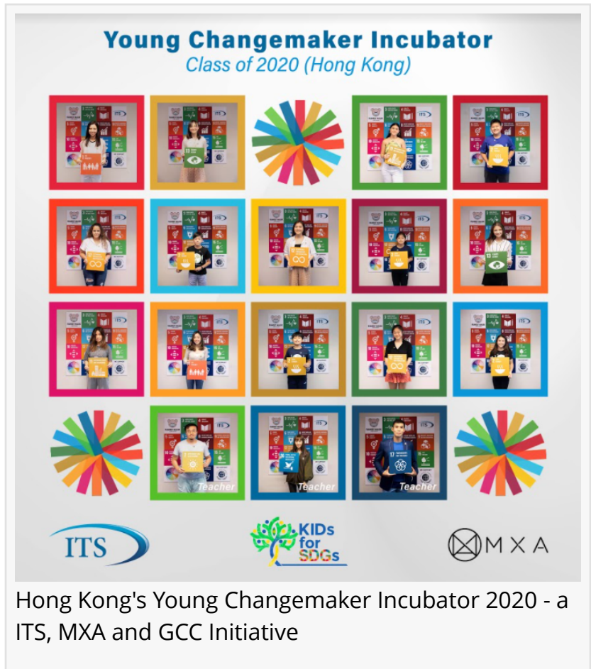
Hong Kong's Young Changemaker Incubator 2020 - a ITS, MXA and GCC Initiative

We came from the problem in synergistic directions. ITS focused on the educational aspect, getting students to approach problems with same research and diligence as a productive academic. MXA focused on bringing students into relevant networks, and helping students build a brand and profile they can call their own. We ran a pilot to see how students would adopt this hybrid education.