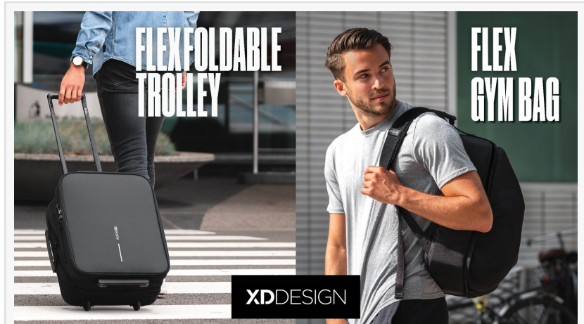
Flex Foldable Trolley & Flex Gym bag by XD Design

Trolley can be made into a compact bag or adjusted to increase space by up to 50 percent. The bag is further suitable for all of life's moments thanks to its durable outer shell and water-repellent coating. The bag's interior contains an inner-support organizing board with fidlock locks to increase organization in a smart way. The Flex Foldable Trolley is also anti-theft with hidden and anti-theft zippers, a TSA-approved lock, and an RFID-protected back pocket to hold your valuables. The bag also comes with a complimentary liquid bag with magnetic lock system and an easy to access front notebook pocket for navigating at security checkpoints with ease.