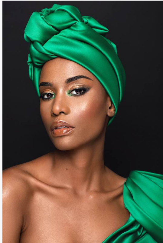
Zozibini Tunzi, Miss Universe

The Latino Commission on AIDS (Commission) is a nonprofit organization founded in 1990 dedicated to meet the health challenges and address the impact of HIV and AIDS, viral Hepatitis, and sexually transmitted infections (STIs) in the Hispanic/Latinx community. The Commission is the leading organization coordinating National Hispanic Hepatitis Awareness Day (May 15), National Latino AIDS Awareness Day (October 15), Latinos in the South, and other prevention,