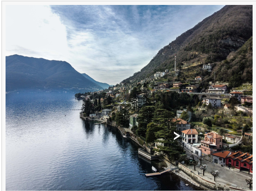
Villa Lucia on the Shore of Lake Como