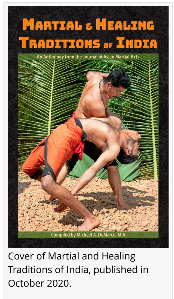
Cover of Martial and Healing Traditions of India, published in October 2020.

This press release can be viewed online at: https://www.einpresswire.com/article/529681149