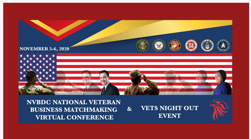
2020 NVBDC National Veteran Business Matchmaking Virtual Conference & Vets Night Out. November 5-6

NVBDC's National Veteran Business Matchmaking Virtual Conference and Vets Night Out is our