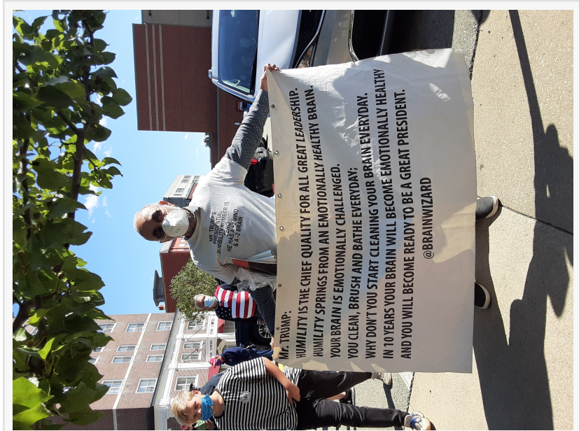
This is the truth about Trump.

HOUSTON, TEXAS, USA, November 2, 2020 /EINPresswire.com/ -- BIDEN -HARRIS HAVE THE ULTIMATE PLAN: THEY WILL PUT AN END TO RAISING OUR SONS INTO EMOTIONAL HEALTH DISASTERS TRANSFORMING AMERICA FROM AN EMOTIONAL HEALTH TRAGEDY TO AN EMOTIONAL HEALTH SUPERPOWER.