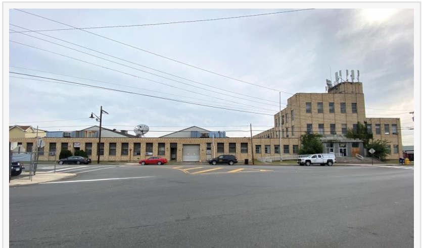
81,386+/-SF of Office/Warehouse

PATERSON, NJ, USA, November 2, 2020 /EINPresswire.com/ -- Max Spann Real Estate & Auction Co is pleased to announce the Auction of the former Passaic County Administration Building located at 305-319 Pennsylvania Avenue in Paterson, New Jersey. The 81,386+/- sq. ft. building will be sold by order of Passaic County in an online only Auction concluding Thursday, December 3, 2020 at 1:00PM. Bidders may bid on their computer or through the Max Spann phone app.