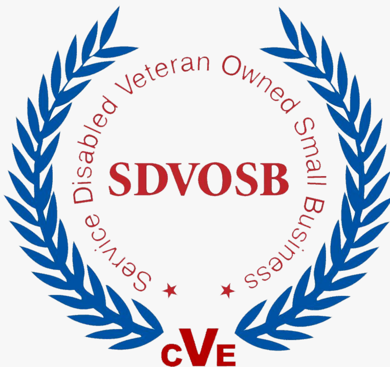
Service Disabled Veteran Owned Business

This press release can be viewed online at: https://www.einpresswire.com/article/529857861 EIN Presswire's priority is source transparency. We do not allow opaque clients, and our editors try to be careful about weeding out false and misleading content. As a user, if you see something we have missed, please do bring it to our attention. Your help is welcome. EIN Presswire, Everyone's Internet News Presswire™, tries to define some of the boundaries that are reasonable