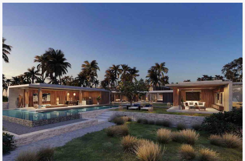
Cap Karoso Beachfront Villa

The soon-to-be-ready SANUBARI is built on the coastline and will offer experiences that enrich personal discovery through the island's nature and spiritual heritage. Set to open with six suites, one can enjoy a myriad of water activities or take part in an ocean view yoga session to find his centre.