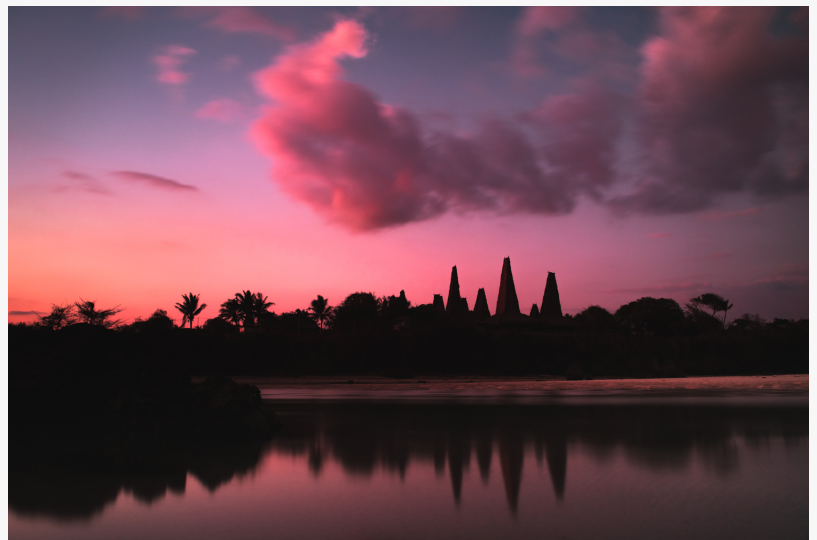
Traditional Sumba Village